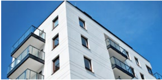
High-Rise Apartment Buildings

From high-rise apartment buildings in New York to mobile home parks in California, AEI has a thorough knowledge of building systems and components for every type of multifamily residential space across the country.